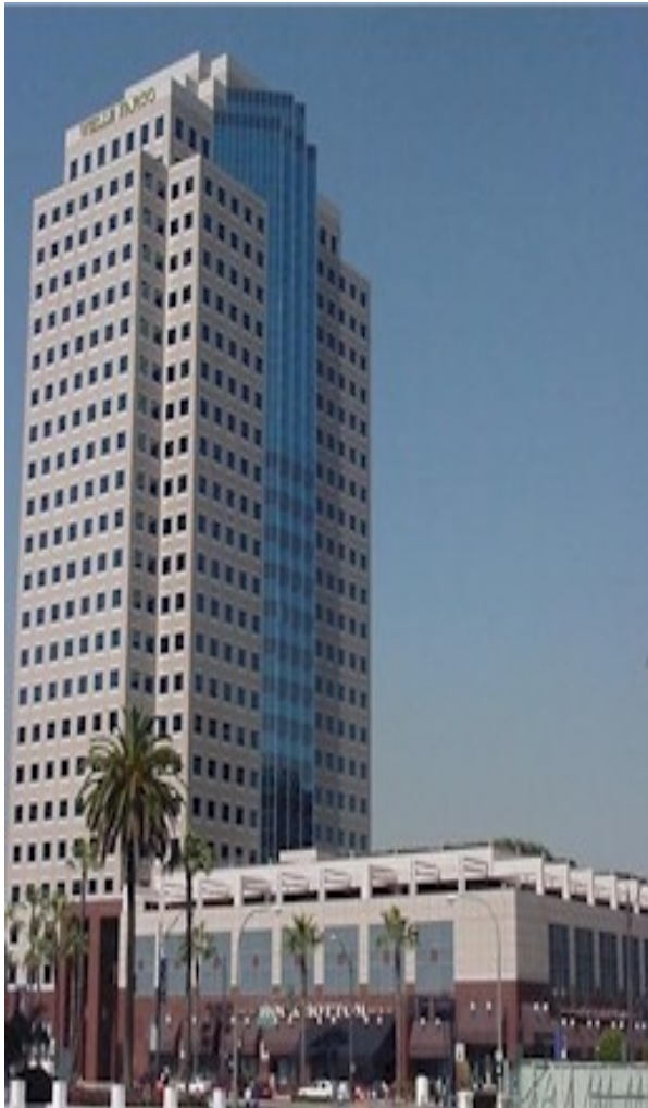
Landmark Square – Downtown Long Beach